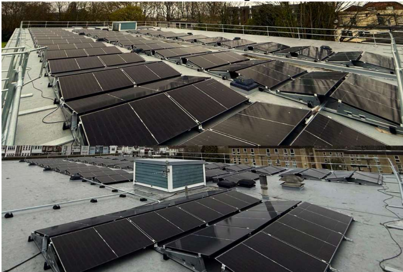
Redland Green Club has gone Solar!

Following the successful installation of 158 solar panels on the clubhouse roof as part of our commitment to sustainability and achieving net-zero emissions by 2030, we are pleased to provide an update on their performance in the first 20 days of operation.